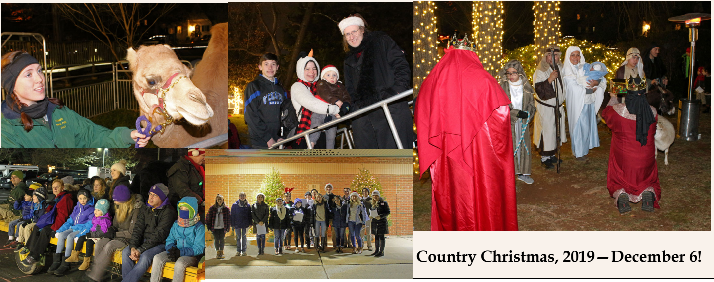
Country Christmas, 2019 – December 6!

On Saturday, December 8, we celebrated our second annual "St. James Country Christmas." The evening featured camel rides, a hayride, a train, live music from Bishop O'Connell High School Choirs and Jazz Band, and fellowship for all. The event was capped off by a live Nativity scene, made possible by members of our Hispanic community. In case you missed it, here are some pictures from the evening. Be sure to join us next year on Friday, December 6, for what promises to be another fun evening for the whole family!