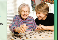
As featured in the Catholic Herald